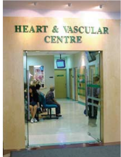
The Heart & Vascular Centre

We are also a member of the Malaysian Society for Quality in Health,