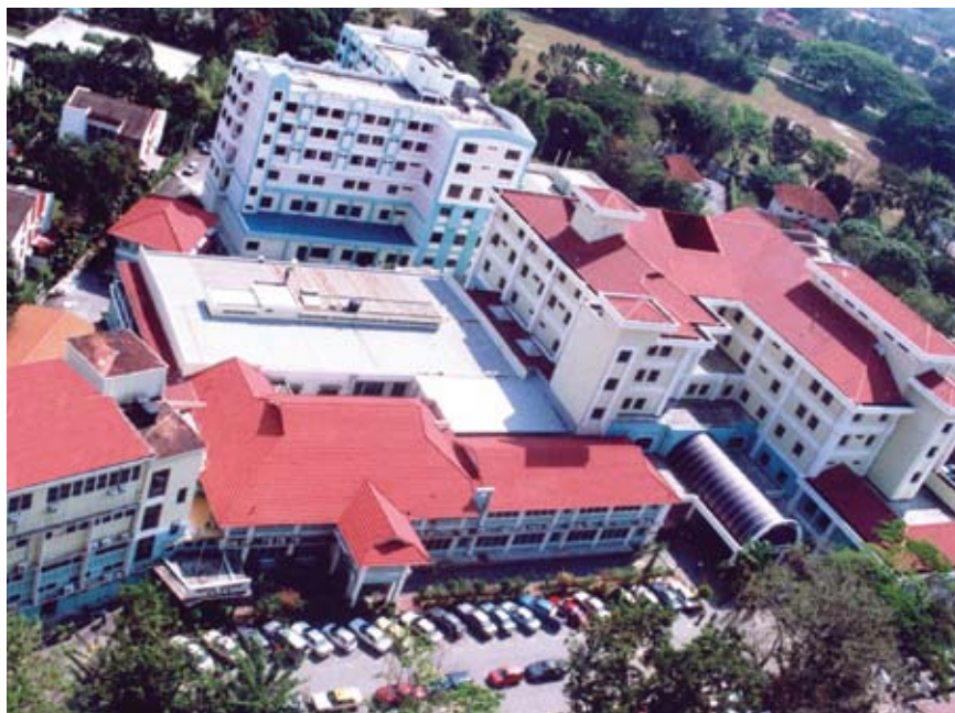
An aerial view of the Penang Adventist Hospital

research organization to conduct trials in the hospital. We have initiated the Cardiovascular Study, an on-going Phase 1 study of a novel compound for the treatment of Type 2 Diabetes.